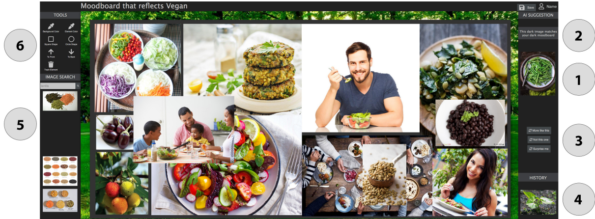
Figure 1: The CCB-based interactive mood board design tool: image suggestion (1), verbal explanation (2), steering controls (3), history panel of previous suggestions (4), image search (5), and editing tools (6).

is an interactive wall display that supports presenting with multimodal and multi-stakeholder feedback.