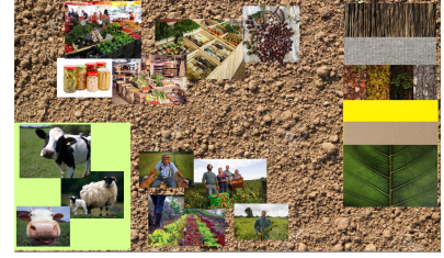
(c) no CCB