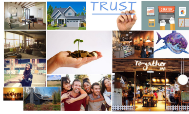
(b) with CCB