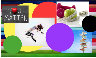
(a) with CCB